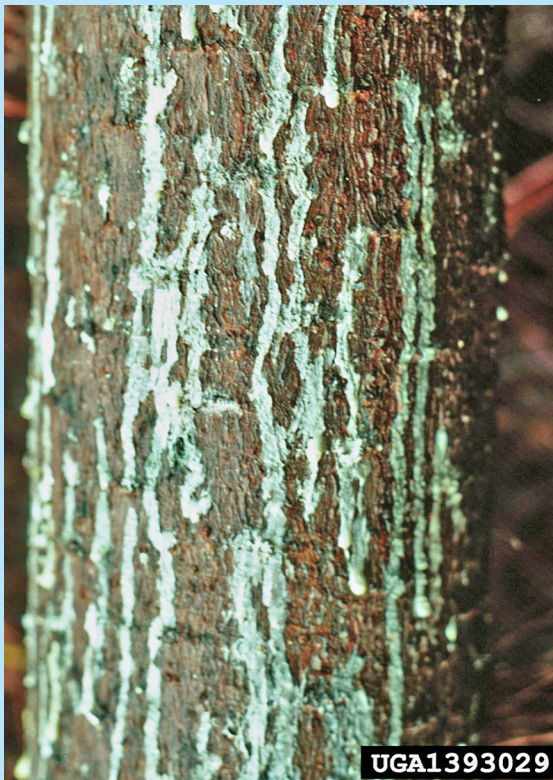
Resin dribbles from oviposition drill wounds.