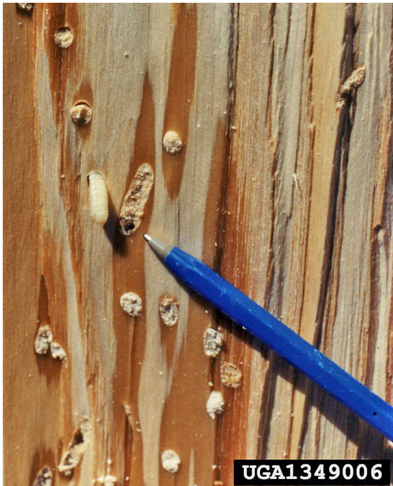
Damage to interior of tree: frass packed mines and fungal stains. Note larva protruding from tunnel.