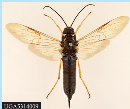
Adult female SWW, showing solid dark-colored body and orange legs (all 3 pairs orange).