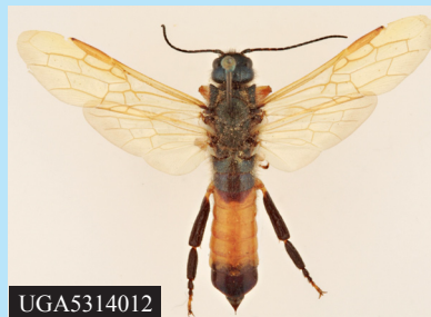
Adult male SWW, showing orange mid-section of abdomen and black hind legs (front 2 pairs of legs are orange).