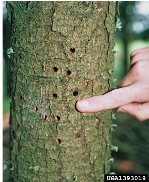
Round exit holes vary in size from 1/8-3/8".

A band of trap trees is a more effective monitoring device than traps using semio-chemical baits. Trap trees and logs 2-4 weeks old generally capture more SWW than baited traps of any sort. Stressed Scots or red pines are preferred as trap trees; white pines are misleading because they often show resin beads even without siren infestation. The most effective time to chemically girdle trap trees is in June, and the herbicide Banvel has proven better than Garlon. Mechanical girdling should be done earlier in the year to allow more time for trees to desiccate, however this method has not proved as efficacious as the use of Banvel. Positive trap trees may also provide a source of infested trees for controlled nematode release, a biological control option.