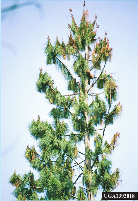
Foliage wilts, needles point straight down and turn light green/yellow to red/brown over several months.