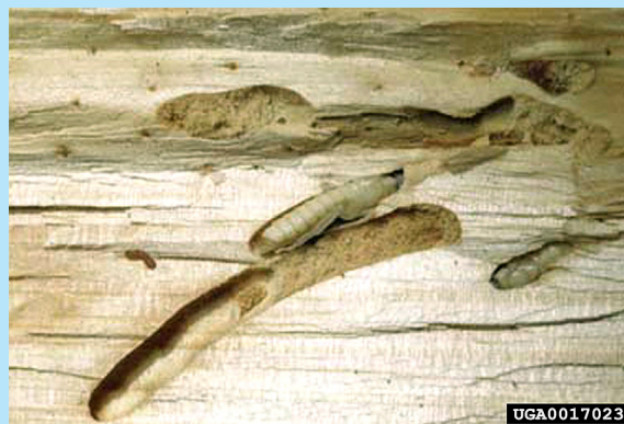
Pupa in chamber and frass packed larval tunnels.