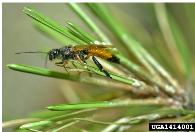
Adult male SWW, actual size.

The Sirex woodwasp (SWW), Sirex noctilio , is an exotic, invasive pest considered one of the top 10 most serious forest insect pests worldwide. These woodwasps attack living pine trees and, in areas where they have been introduced, have caused extensive losses. In the U.S., a single SWW was first detected in an Indiana warehouse in 2002, but no others were found in a follow-up survey. Then in 2004, a female was collected in a funnel trap at a forest edge by a field in Oswego County, NY, indicating an established population existed. If not controlled, SWW poses a serious threat to pine forests and plantations in North America.