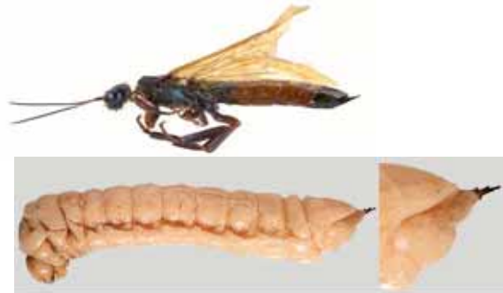
Figure 3. Sirex noctilio —larva and close-up of posterior spine.

The wood wasp Sirex noctilio is considered a secondary pest within its native range (Europe), but proved to be a very serious pest of Pinus when introduced into Australia, New Zealand, and South America. Much of the insect's pest status results from its association with the phytotoxic fungus Amylostereum areolatum , which female wasps inject into trees (along with a toxin) at the time of oviposition. Larvae burrow into the tree, but apparently derive much of their nutrition from feeding on the fungus.