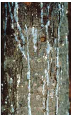
Exit holes and sap flow from a Sirex infested tree

Potential hosts are widespread and common, and S. noctilio appears capable of surviving climatic conditions within much of the U.S. In addition, the insect is a strong flier and can spread rapidly, which would make eradication difficult. Reports in the literature indicate that adults can travel up to 100 miles, but more likely expectations (based on experiences in Australia) suggest that an infestation would expand at 5 to 15 miles per year.